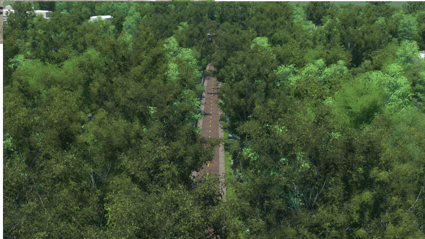
Overhead view of paved trail with stone dust shoulders