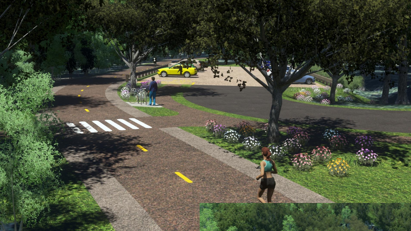
Lavender Lane parking area