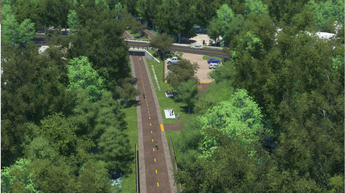
Concord Road parking area and underpass