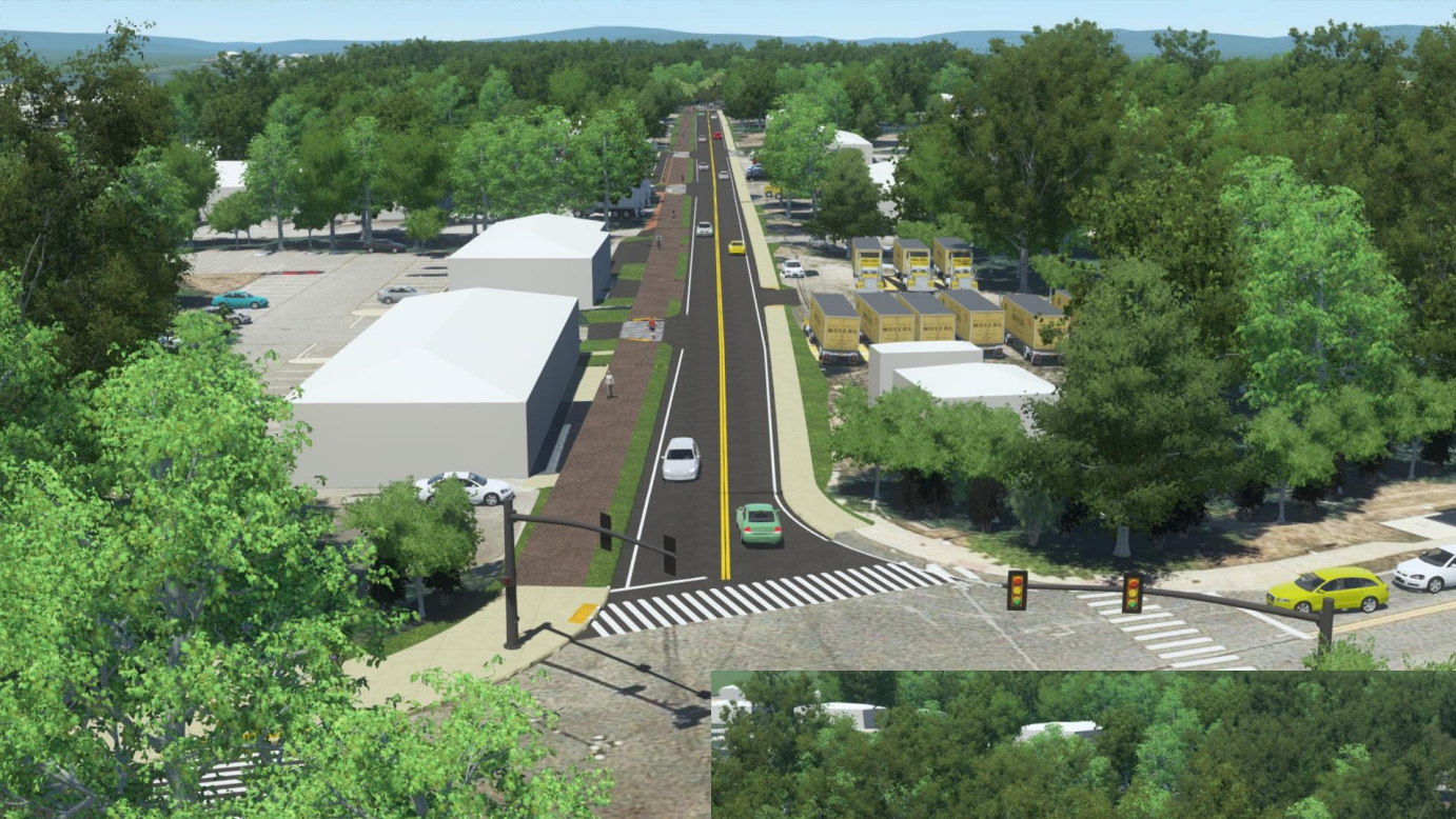
Railroad Avenue looking west with new shared use path and sidewalk