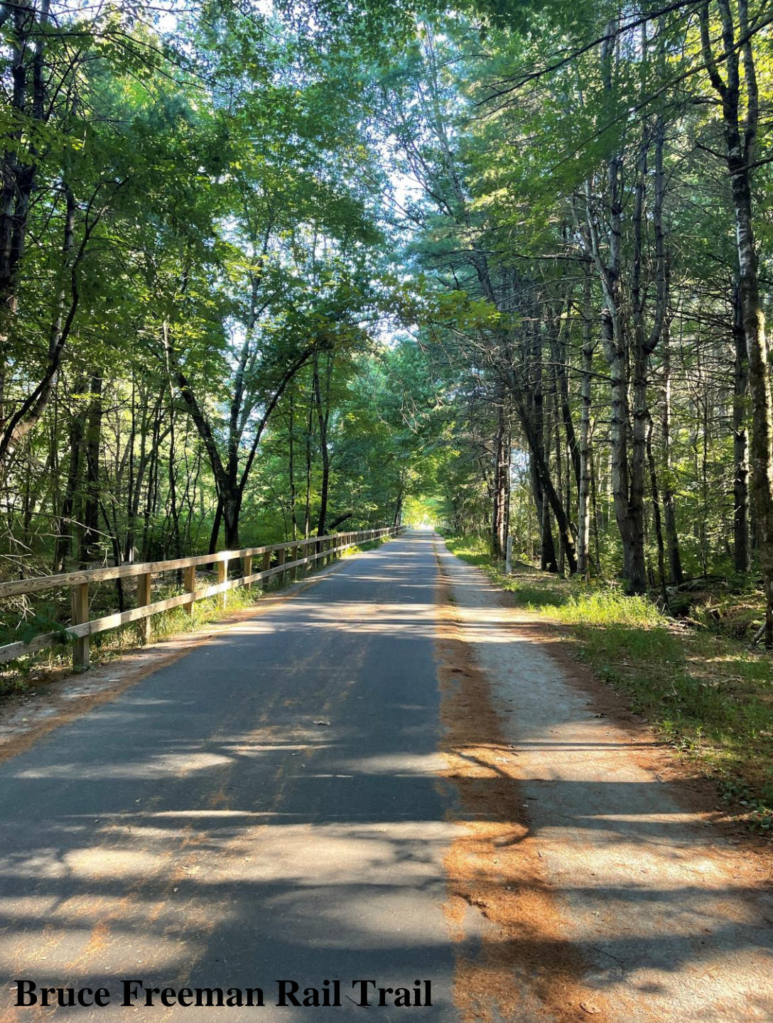
Bruce Freeman Rail Trail