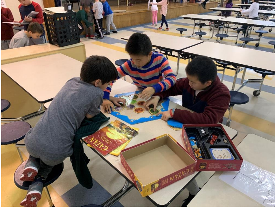
Gameplay at Lane

All of us here at Kids' Club wish you all a warm and wonderful holiday season, and a Happy New Year.